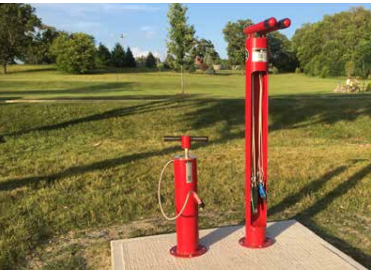
BICYCLE REPAIR STATION