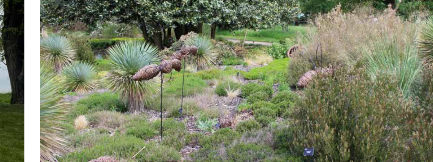
REGIONALLY ADAPTED PLANTS FOR POLLINATORS