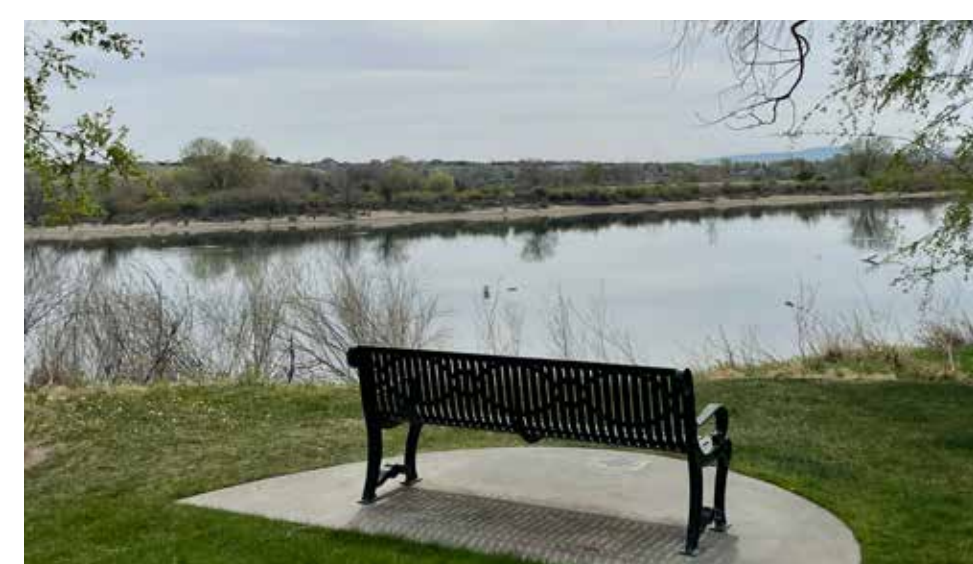
INCREASE VISUAL ACCESS TO RIVER IN SELECT LOCATIONS