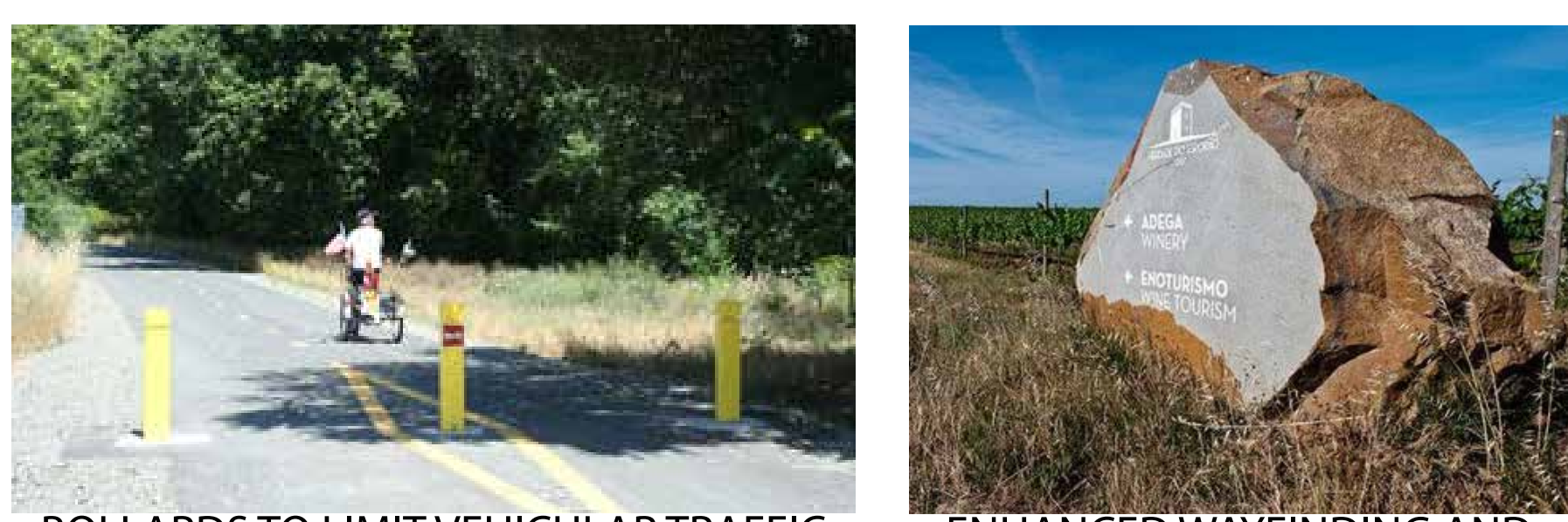
BOLLARDS TO LIMIT VEHICULAR TRAFFIC