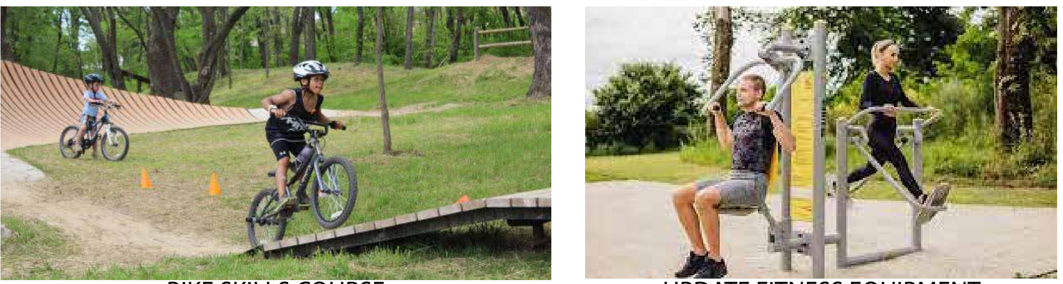
BIKE SKILLS COURSE