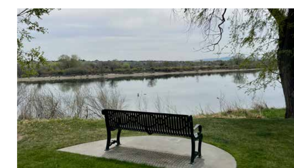
INCREASE VISUAL ACCESS TO RIVER IN SE-LECT LOCATIONS