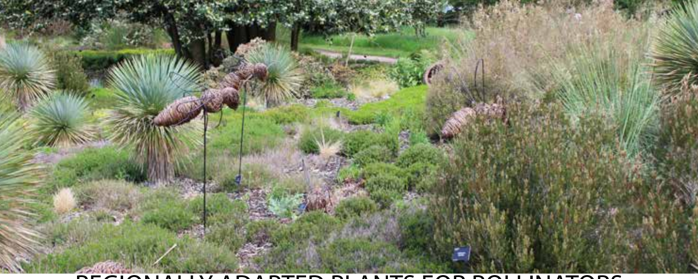
REGIONALLY ADAPTED PLANTS FOR POLLINATORS